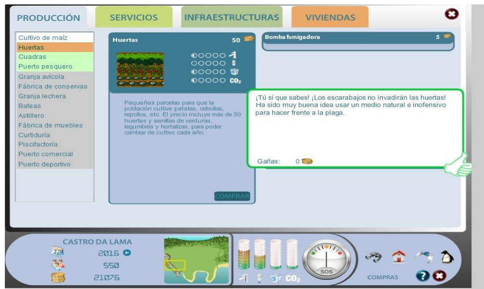
Figure 2. Praise after taking the right decision in Climántica

An analysis of the feedback and reward system reveals the prevalence of positive discourse (figure 2).